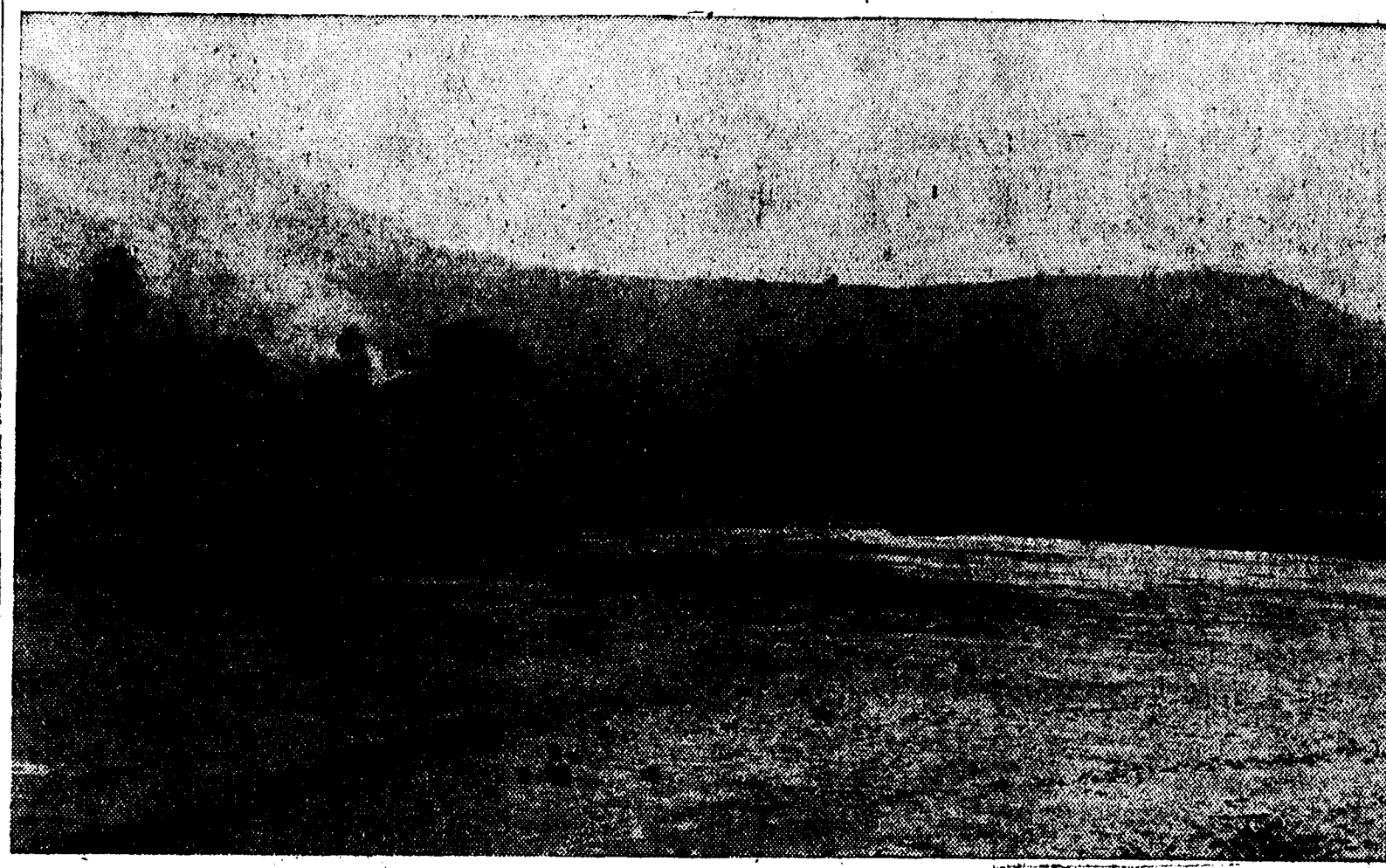
A general view of Bharat's factory at Uran.

the Bombay Factory was started again. The quality of the Bharat tiles was brought up to such a high standard that gradually the imports